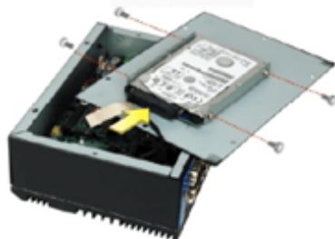
2.5" HDD installation