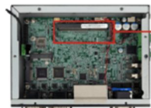
DIMM Slot Location