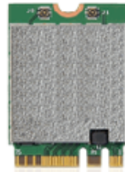
M.2 A key