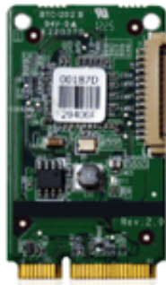
Full-size PCIe Mini